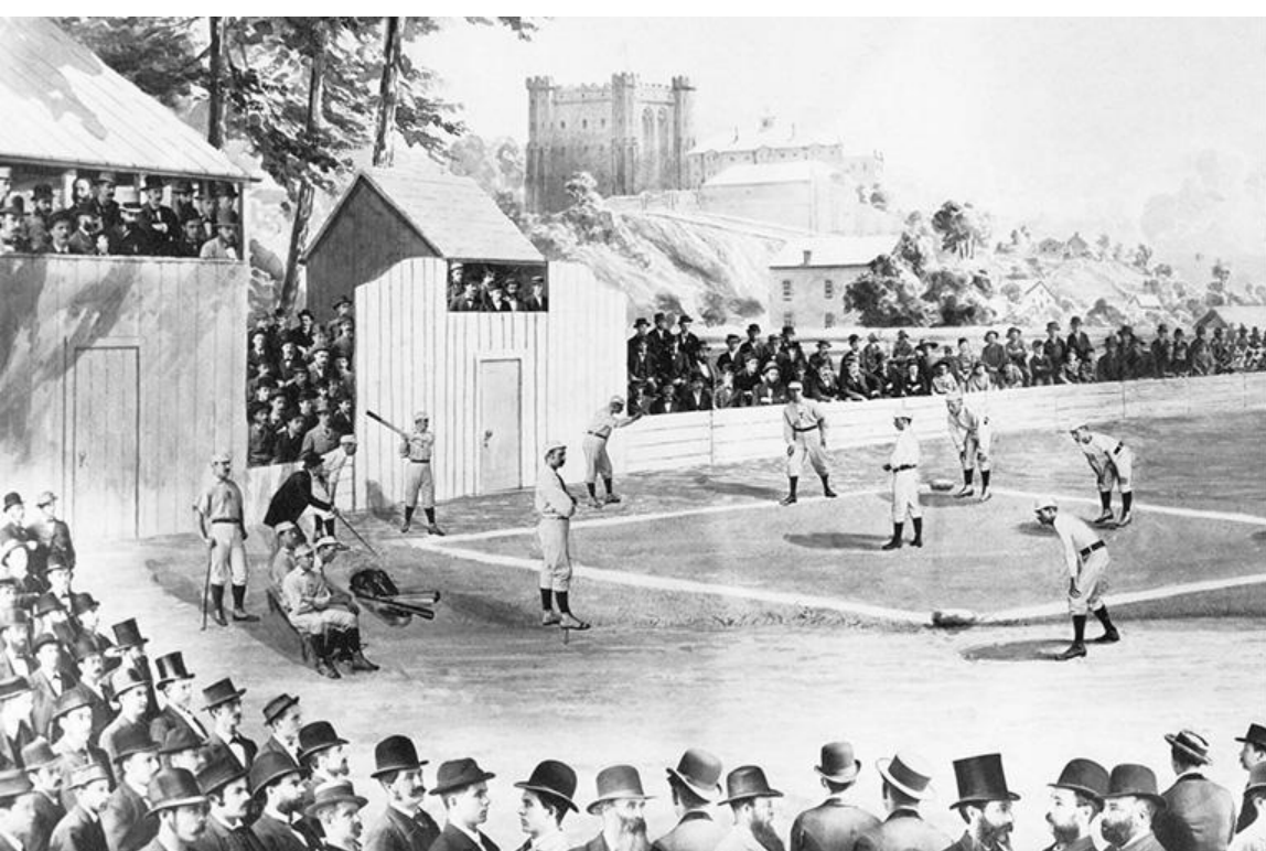
Image showing an early baseball game held at Tecumseh Park in the 1870s. The Middlesex County Courthouse is depicted in the distance.

To highlight its importance in Canadian sport history, Labatt Memorial Park—the world's oldest baseball grounds—is worthy of recognition as a National Historic Site of Canada.