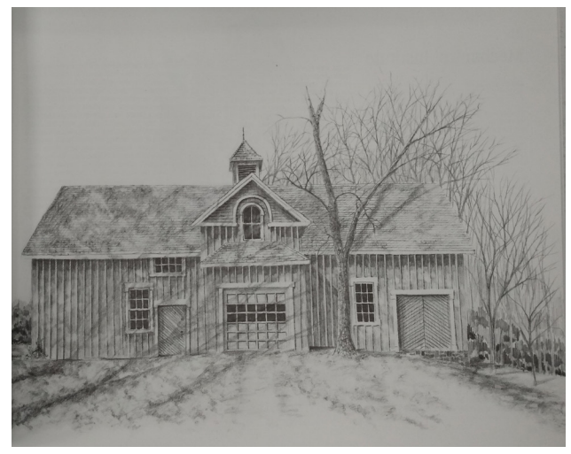
William Griffiths' barn as drawn by Louis Taylor in Nancy Tausky's Historical Sketches of London: From Site to City. Broadview Press, 1993

City Hall then launched an investigation. There were two illegalities: First, the barn was demolished without a permit, which goes against the Ontario Building Code. Second, since it was heritage designated, the demolition defied the Ontario Heritage Act, meaning the building should not have been demolished or significantly altered without the municipality's permission. City bylaw officers charged the owner under both acts.