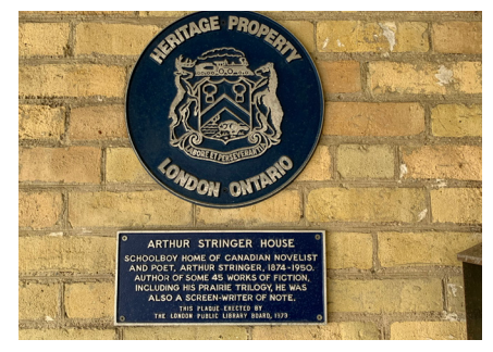
Heritage London plaque, Arthur Stringer House