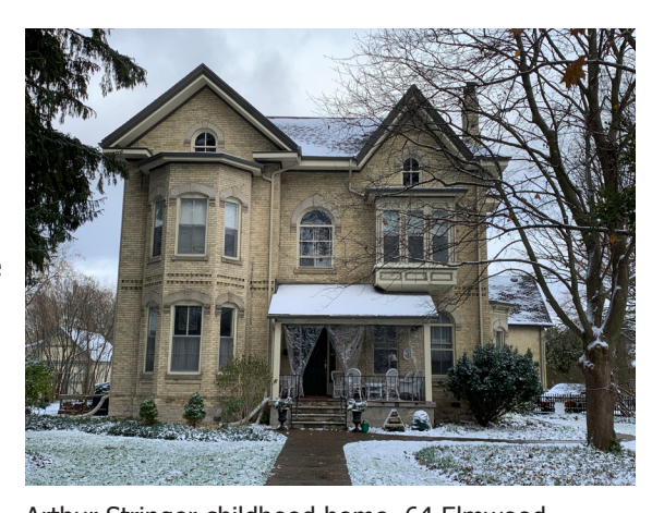
Arthur Stringer childhood home, 64 Elmwood Avenue