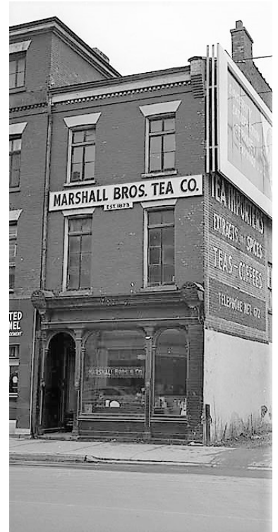
The Marshall Bros. Tea Co. at 67 Dundas St. July 12, 1968.