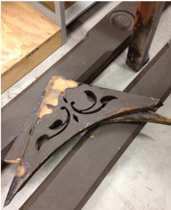
Untagged pieces of the 67 Dundas St building façade UWO Archives.