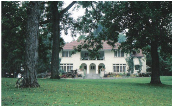
The Elsie Perrin Williams Estate celebrates its 100th anniversary throughout November 2017.

Admission: $15 per person per evening event. All funds raised will go to the preservation of the historic estate house. All events take place at the Elsie Perrin Williams Estate, 101 Windermere Road West. For more information visit www.elsieperrinwilliamsestate.ca .