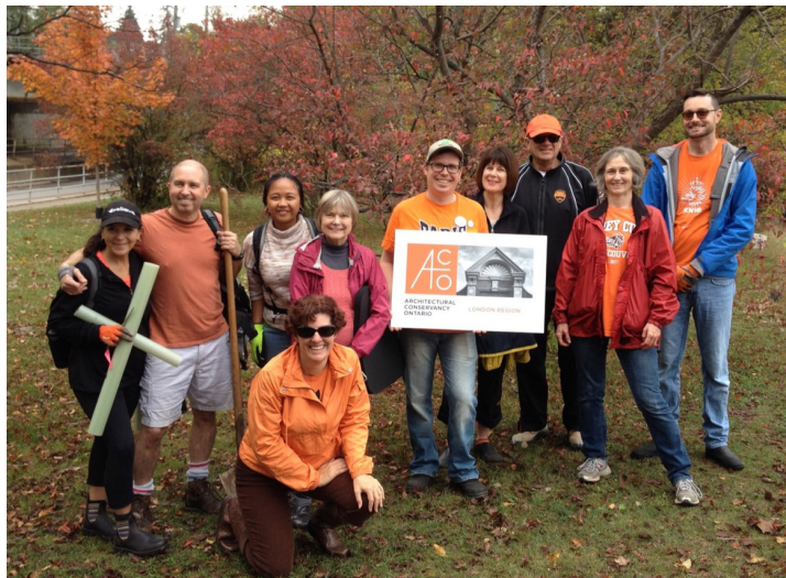
Planting fifty trees in Thames Park with ReForest London in honour of ACO London's 50th anniversary, October 14.