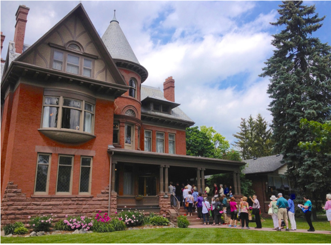
The 44th annual Geranium Heritage House Tour: Piccadilly Promenade. June 4. 336 Piccadilly.