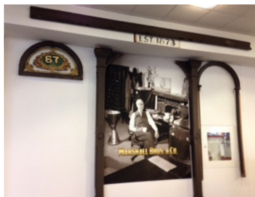
The Marshall Bros. Tea Co.