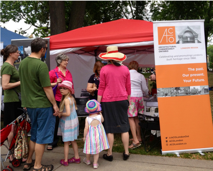
ACO London's booth at the Home County Festival, July 14-16. Home County Festival.