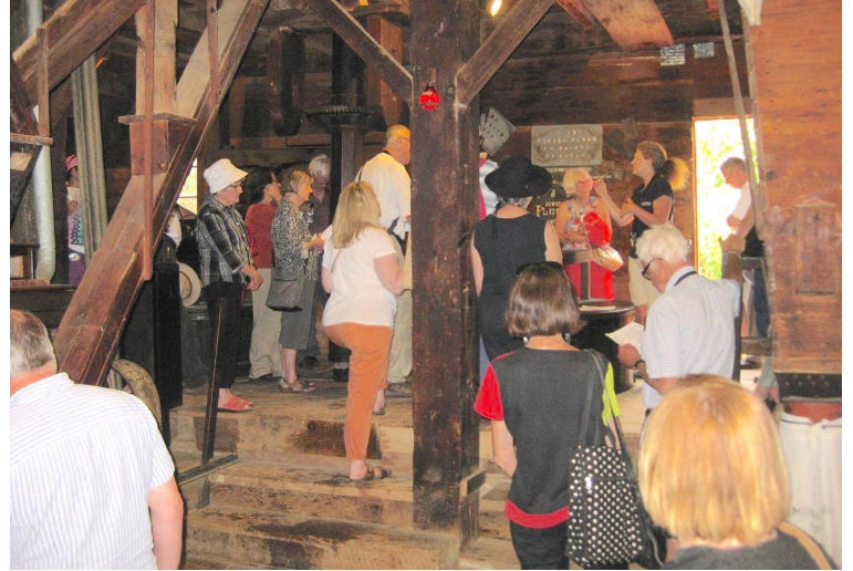
The ACO London and London Middlesex Historical Society joint bus tour to Vittoria and Backus Mill, September 23. Inside Backus Mill.