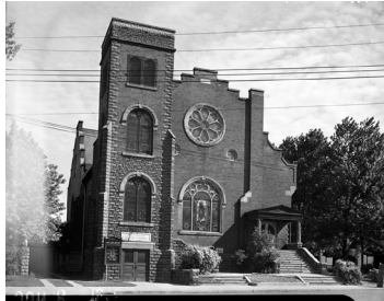
Hyatt Avenue United Church was featured by the Free Press Saturday, June 8, 1946. The building that still stands is empty and deteriorating.