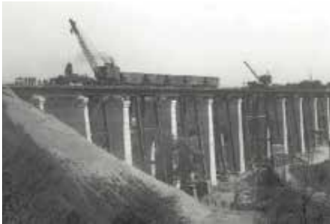
MCS Bridge under construction, 1929

In 2012 the group launched a public fundraising effort and purchased the 1930's era Michigan Central Railroad Bridge over Kettle Creek, along with some 4km of associated rail bed. With tracks already removed, the group decided to redevelop the site into Canada's first Elevated Park,