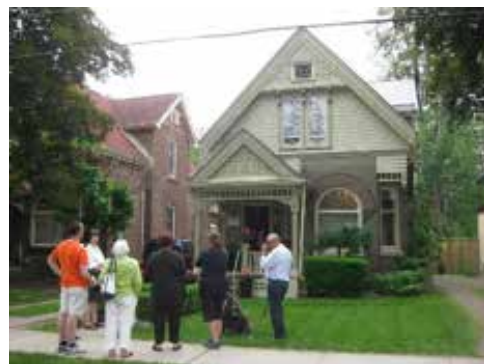
897 Lorne Avenue