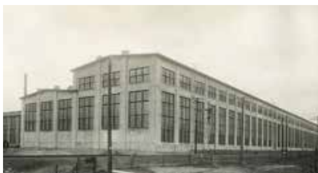
Grand Trunk Shops, No Date

ACO Stratford/Perth County's signature historical plaque program continues to help citizens and tourists connect with history of the community by identifying with a plaque the date built and the first resident for residential, commercial and other properties built pre-World War II. Today we have more than 145 on display with 14 to be researched. Fortunately, we have four more members on our research team. On April 20, 2015, an unexpected motion to demolish all but three bays of the GTR/CNR Locomotive repair shops was narrowly deferred for a week. A week later council voted 9-2 to reject the Riversedge Development proposal for the site, and entertained new public presentations that urged preservation of the shops. After a lengthy debate, the matter was again deferred, this time to a special meeting of council in May.