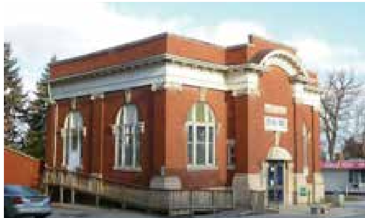
Ingersoll Carnegie Library, Left: c. 1910 Right: 2015

Our Carnegie Library, built in 1910, has graced Charles Stree in downtown Ingersoll for 105 years and provided an important focal point for the community to the present day. The library is one of 125 built in Canada by a grant from the Andrew Carnegie Foundation and one of only 95 still standing in Ontario. Owned by the Town of Ingersoll, the Carnegie Library is little different than it was on its first day of operation and , up until December 2014, it was being used as a meeting place for a local community group for young people. However, the inevitable passage of time has taken its toll on the building. This past year the Ingersoll Town Council was informed that the building was no longer safe for occupants and that at least $400,000 of repairs were required to remain in use - a hefty bill for a small community like ours.