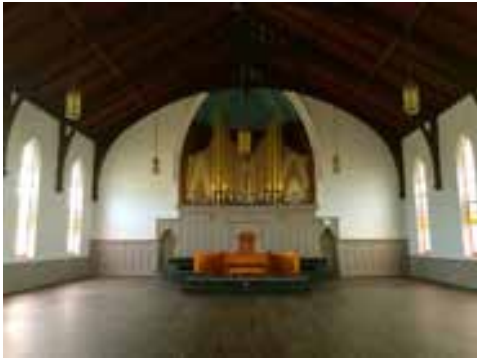
The Kent 1875 Interior

A 19 th century decommissioned Baptist church has been carefully restored. Now named The Kent 1875 (after its year of completion), the two storey building opened in August as a centre for concerts, weddings, and special events in Chatham.