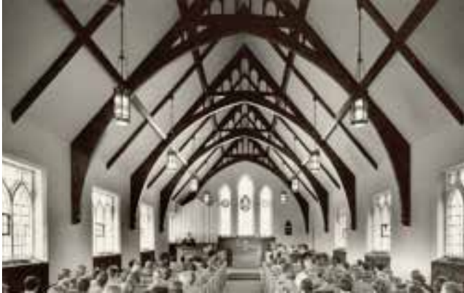
Alma College Chapel - 1956