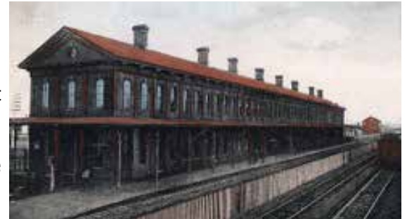
CASO Station, Postcard, No date - Source: Canada Southern Railway